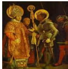
Saint Maurice (born 250 A.D. died in A.D. 286) Feast Day: September 22