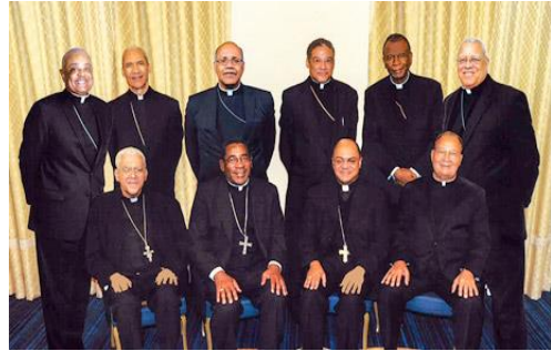
African American US Catholic Bishops

Black Catholic History Month is a time for us to celebrate the contributions of Black Catholics to the Roman Catholic tradition.